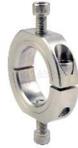
*Additional hardware #01 included