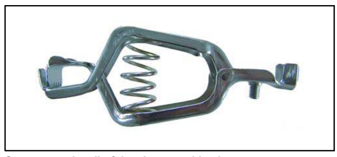
See page 21 for clip & insulator combinations.