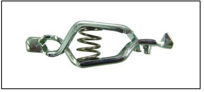
See page 20 for clip & insulator combinations.