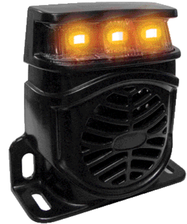
LED STROBE BACK UP ALARM