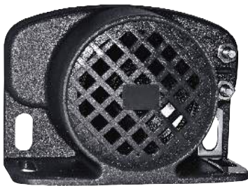
BACK UP ALARM

Applications include: Service/Fleet Vehicles, Delivery Trucks, Construction Vehicles, Heavy Equipment, Utility Trucks, Tractor-Trailers, and Fork-Lifts