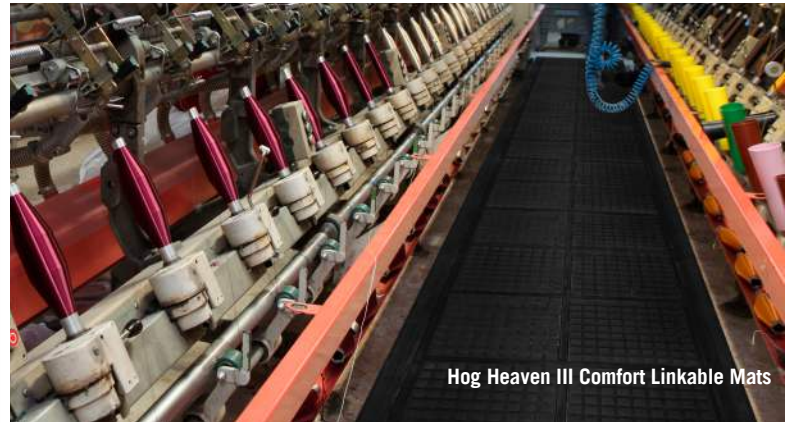
Hog Heaven III Comfort Linkable Mats

Note: Mat sizes are approximate as rubber shrinks and expands in conjunction with temperature and time. Tolerable manufacturing size variance is 3-5%.