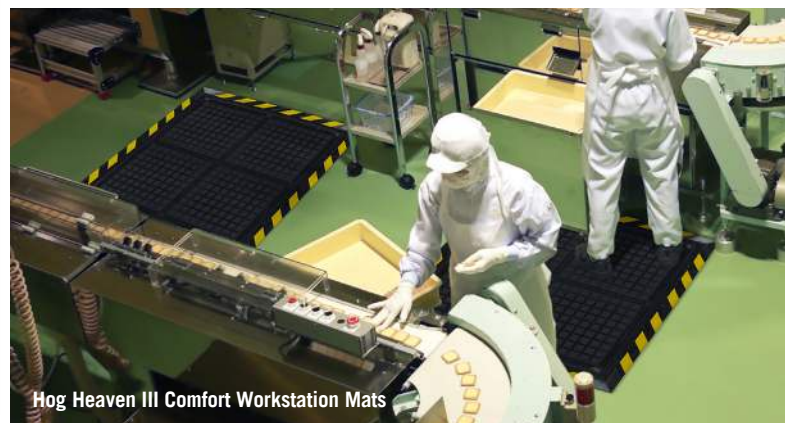
Hog Heaven III Comfort Workstation Mats