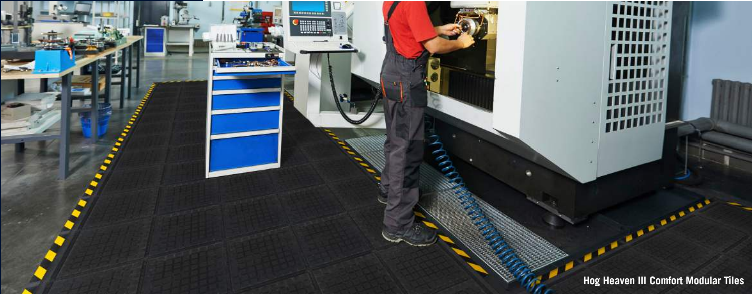
Hog Heaven III Comfort Modular Tiles