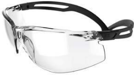
SF501AS-BLK 7100228758 Lens: Clear, AS Frame Color: Black