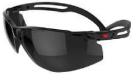
SF502SGAF-BLK 7100239089 Lens: Gray, SGAF/AS Frame Color: Black