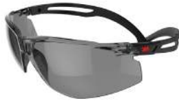
SF507SGAF-BLK 7100239091 Lens: Indoor/Outdoor Gray, SGAF/AS Frame Color: Black