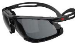
SF502SGAF-BLK-FM 7100239195 Lens: Gray w/Foam Gasket Frame Color: Black Coating: SGAF/AS