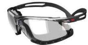
SF507SGAF-BLK-FM 7100239092 Lens: Indoor/Outdoor Gray w/Foam Gasket Frame Color: Black Coating: SGAF/AS