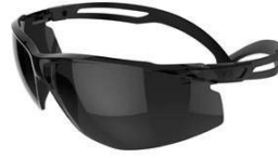
SF502AF-BLK 7100228722 Lens: Gray, AF/AS Frame Color: Black