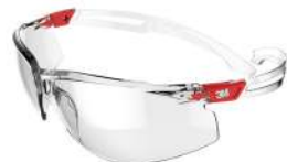
SF501SGAF-RED 7100239194 Lens: Clear, SGAF/AS Frame Color: Clear & Red