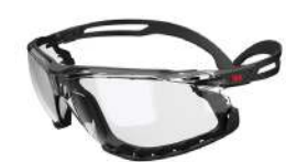
SF501SGAF-BLK-FM 7100238909 Lens: Clear w/Foam Gasket Frame Color: Black Coating: SGAF/AS