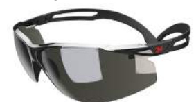
SF509AF-BLK 7100239203 Lens: Silver Mirror, SAF/AS Frame Color: Black