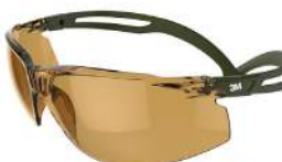
SF528SGAF-DGR 7100239088 Lens: Light Brown, SGAF/AS Frame Color: Olive Green