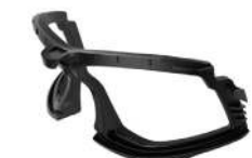
SF500-FOAM 7100239114 Foam Gasket Accessory

Give them a try—request a sample at 3M.com/SecureFit