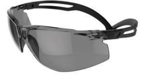
SF507AF-BLK 7100228721 Lens: Indoor/Outdoor Gray, AF/AS Frame Color: Black