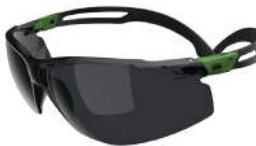
SF550AF-GRN 7100239205 Lens: IR 5.0 Gray, AF/AS Frame Color: Green & Black