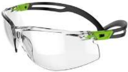
SF501SGAF-GRN 7100239087 Lens: Clear, SGAF/AS Frame Color: Green & Black