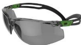
SF530AF-GRN 7100239086 Lens: IR 3.0 Gray, AF/AS Frame Color: Green & Black