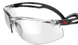
SF501SGAF-BLK 7100238910 Lens: Clear, SGAF/AS Frame Color: Black