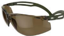
SF505SGAF-DGR 7100239191 Lens: Brown, SGAF/AS Frame Color: Olive Green