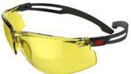
SF503SGAF-BLK 7100239090 Lens: Amber, SGAF/AS Frame Color: Black