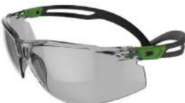
SF517AF-GRN 7100239204 Lens: IR 1.7 Gray, AF/AS Frame Color: Green & Black