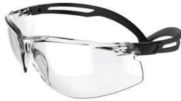
SF501AF-BLK 7100228736 Lens: Clear, AF/AS Frame Color: Black