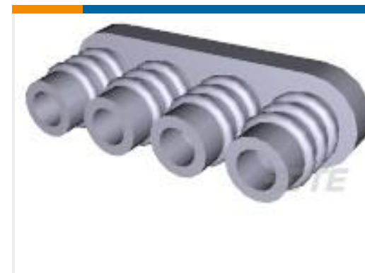
TE Part #794274-1 04P UMNL WIRE SEAL