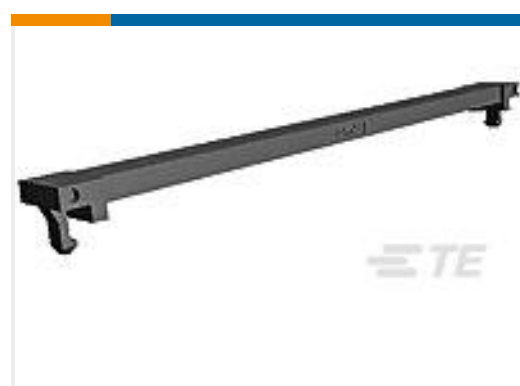
TE Part #111547-6 026 UNIV I/O STRAIN RELIEF