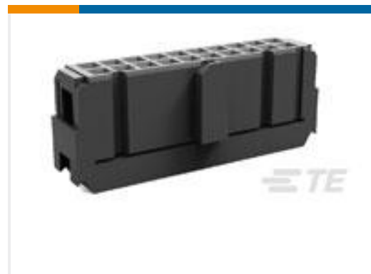
TE Part #1658621-2 14 NOVO MIL/CTR 15DP, LEAD FREE