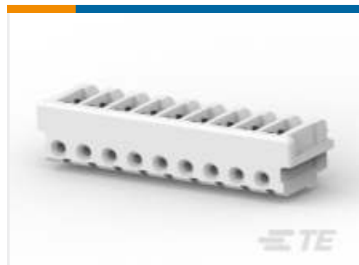
TE Part #2-179694-2 AMP COMMON TERMINATION HOUSINGS