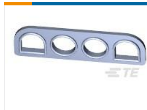
TE Part #794273-1 04P UMNL INTERFACE SEAL