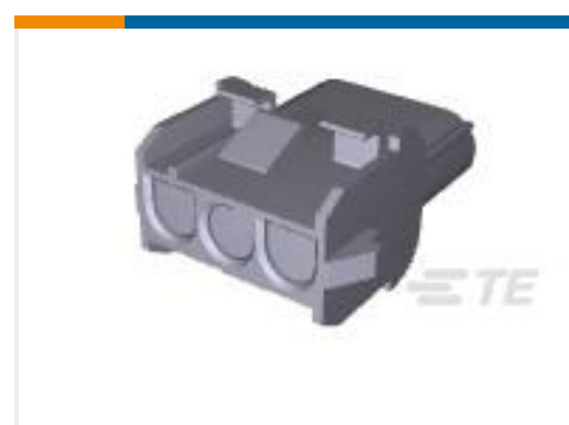
TE Part #2178474-2 3POS UMNL CAP HSG V0 GW