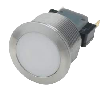
MSM 22 CS ST