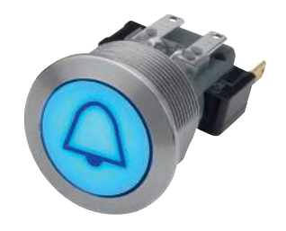
MSM 19 CS LE BL blue Lettering Example for Positive Lettering