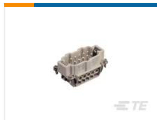
TE Part # T2040102101-000 HE-010-M