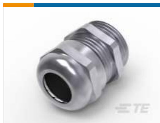
TE Part # T3609160101-000 DLX-16-MS