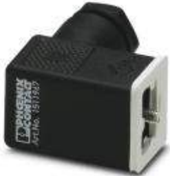
Valve connector, 4-pos., type C, unconnected, screw connection, cable screw connection Pg7

Please be informed that the data shown in this PDF Document is generated from our Online Catalog. Please find the complete data in the user's documentation. Our General Terms of Use for Downloads are valid ( http://download.phoenixcontact.com )