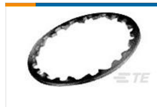
TE Part #1-329632-2 LOCKWASHER, PLATED