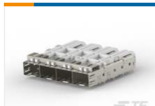
TE Part #1761008-3 SFP 1X4 CAGE & LIGHT PIPE KIT