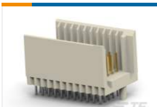
TE Part #5646346-1 Hard Metric Male Connector: Traditional Backplane, Mezzanine, 2mm