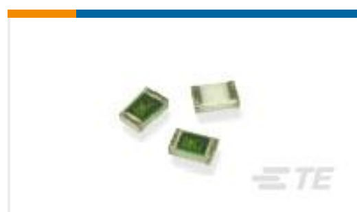
TE Part #8-2176092-1 RP 2A 0.25W 5K36 0.1% 25PPM 1K RL