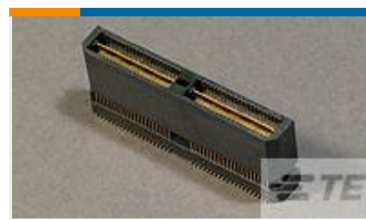
TE Part # 1658047-2 MSB0.80PL16ASY080FL,-,F,-TY