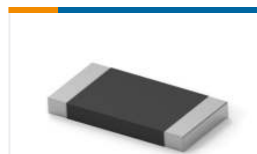
TE Part #1-2176422-8 TLRP 2512 3.0W R004 1% 25PPM 4K RL