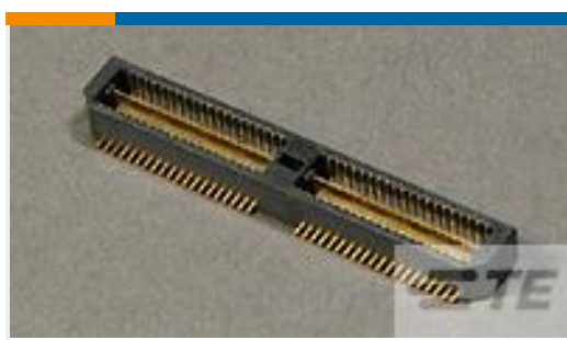
TE Part # 1658044-2 MSB0.80PL5ASY080FL,-,F,-TY