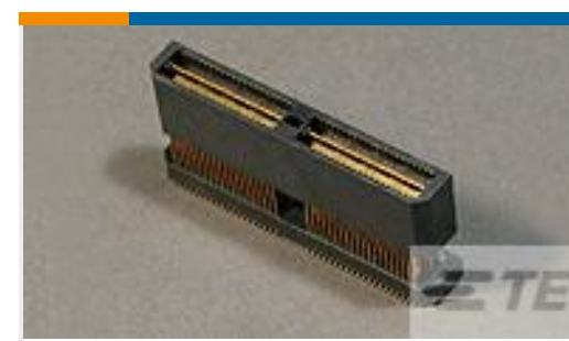
TE Part # 1658048-2 MSB0.80PL19ASY080FL,-,F,-TY