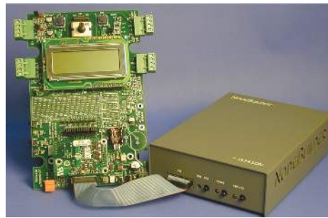
Gizmo 4 plugged into the LTM-10A Platform

The NodeBuilder Gizmo 4 I/O Board is included with the NodeBuilder FX/PL Development Tool. You can use this collection of I/O devices with the LTM-10A Platform to develop prototype devices and I/O circuits, develop special-purpose devices for testing, or run the NodeBuilder examples.