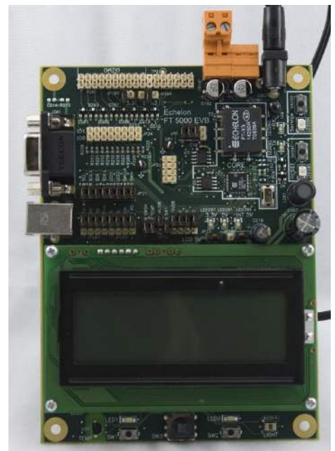
FT 5000 EVB Evaluation Board

Two FT 5000 EVB Evaluation Boards are included with the NodeBuilder FX/FT Development Tool and the NodeBuilder FX/FT Classroom Edition. The FT 5000 EVB is a complete Series 5000 LonWORKS device that you can use to evaluate the LonWORKS 2.0 platform and create LonWORKS 2.0 devices. The FT 5000 EVB includes an FT 5000 Smart Transceiver with an external 10MHz crystal (you can adjust the internal system clock speed from 5MHz to 80MHz), an FT-X3 communication transformer, 64KB external serial EEPROM and flash memory devices, and a 3.3V power source.