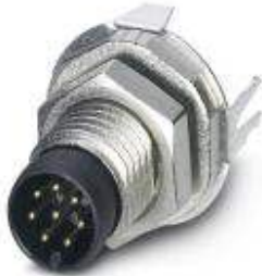
Sensor/actuator flush-type plug-in connector, plug, 8-pos., M8, rear/screw mounting with M8 fastening thread, with straight solder connection

Please be informed that the data shown in this PDF Document is generated from our Online Catalog. Please find the complete data in the user's documentation. Our General Terms of Use for Downloads are valid ( http://download.phoenixcontact.com )