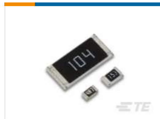
TE Part #1-2176337-9 CRGCO 0402 330R 1%