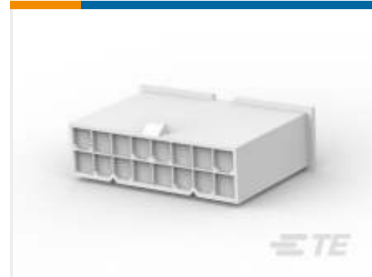
TE Part # 1-1969612-6 16P FH PLUG VAL-U-LOK V0