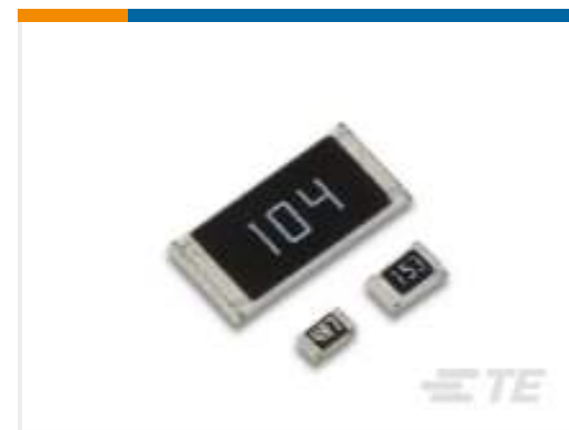
TE Part #5-2176339-2 CRGCO 0603 180K 1%