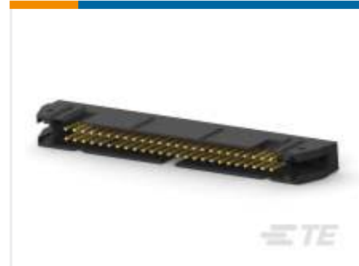
TE Part #5499922-6 AMP-LATCH UNIVERSAL HEADERS