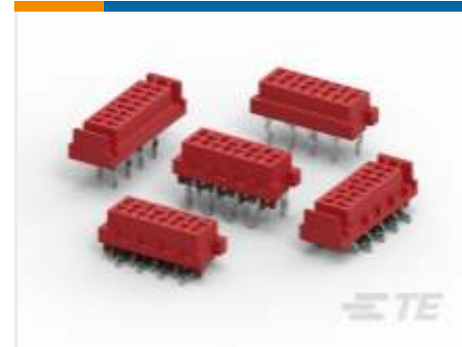
TE Part #7-215079-4 Female-on-Board Connector, Top Entry