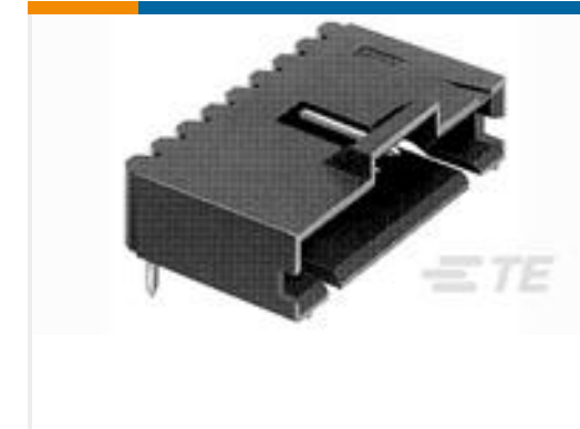
TE Part #5-103634-2 03 MTE HDR SRRA LATCH.100CL LF