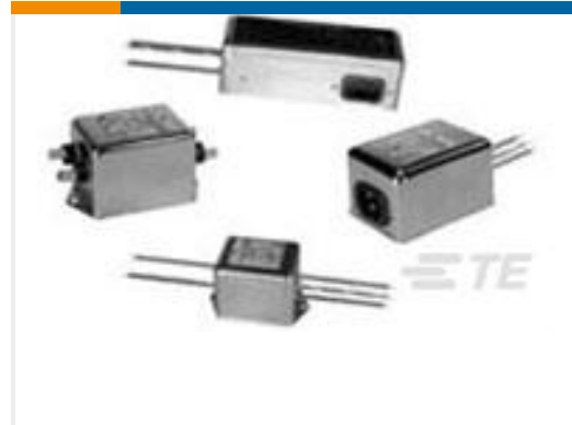
TE Part #6609048-9 20EQ1 M0=F7776