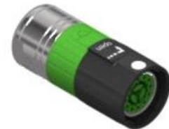
Contact Arrangement mating view

E ST A 002 NN 00 31 0001 000 E S A 002 N 00 31 0001 000