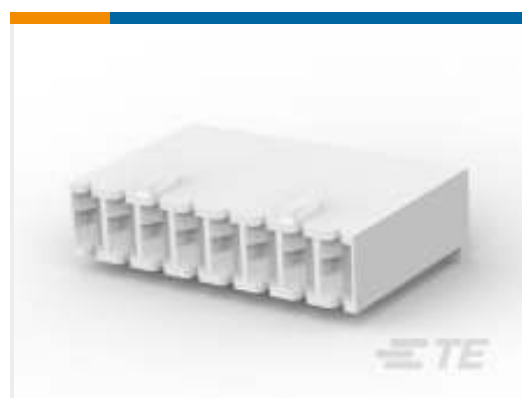
TE Part # 1241980-8 SPECIAL STANDARD TIMER HOUSING 8POS