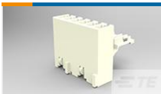
TE Part #1241964-7 STD TIM HOUSING 7P