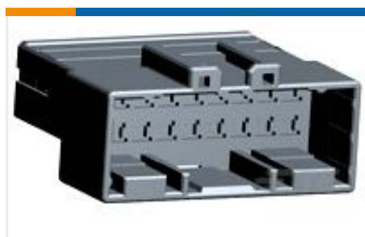
TE Part #936213-2 090III 18P CAP ASSY BLK