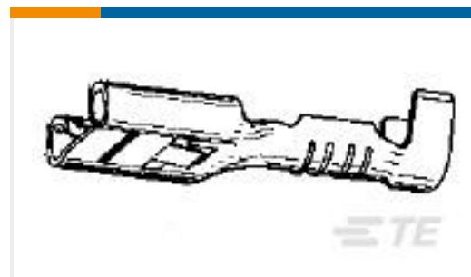
TE Part #282178-1 FF 250 REC 0.3-0.8MM2 BR