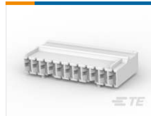
TE Part # 1-1241964-1 11POS STANDARD TIMER HOUSING