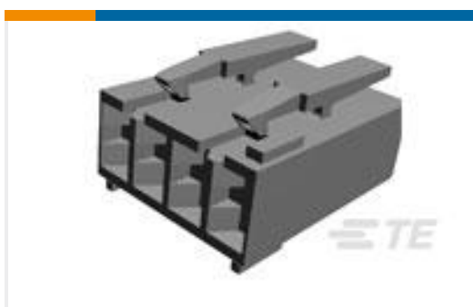
TE Part #2-1241959-4 STD TIM HOUSING MKII 4POS