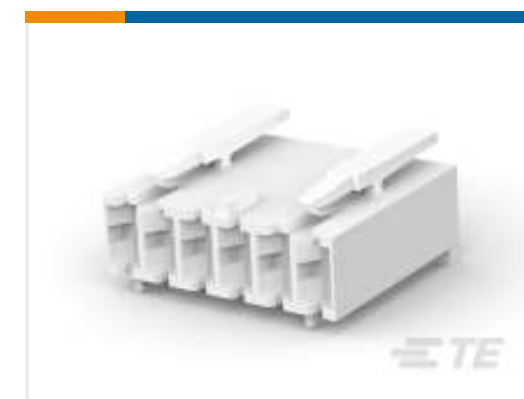
TE Part # 1241965-6 STD-TIMER GEH 6P