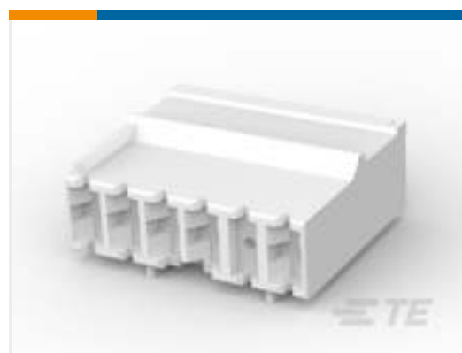
TE Part # 5-1703060-6 STANDARD TIMER SPECIAL HOUSING UL94_V0