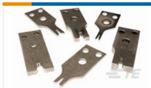
TE Part #1-1752057-3 CRIMPER, WIRE, STEPPED (.070)