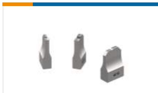
TE Part #1-1333231-1 ANVIL, COMBINATION, SPECIAL