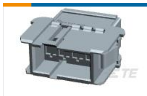
TE Part #9-927742-4 4POS FASTIN FASTON HOUSING