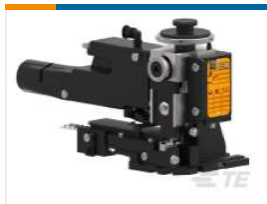
TE Part # 2151743-2 OCEAN_2.0_Applicator-S-080F1400V