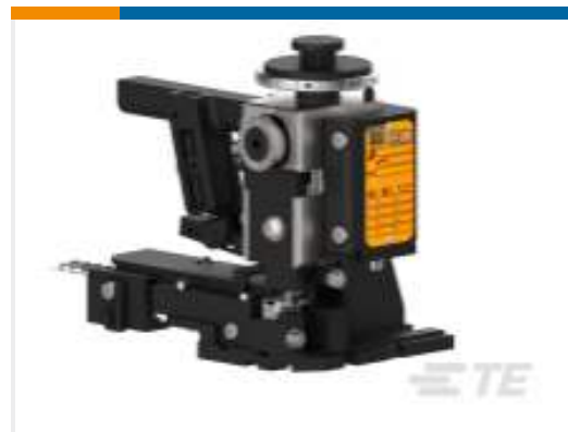
TE Part # 2151743-1 OCEAN_2.0_Applicator-S-080F1400V