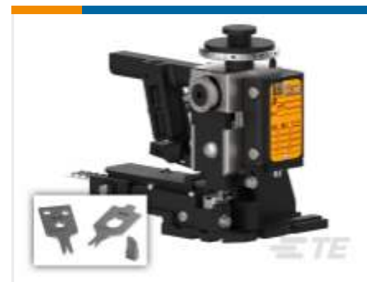
TE Part # 7-2151743-1 OCEAN_2.0_Applicator-S-080F1400V