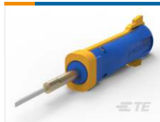
TE Part # 1452426-1 EXTRACTION TOOL