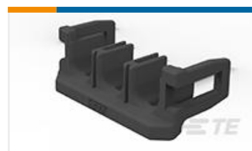
TE Part #1971777-3 PTL TPA HIGH TEMP 1 x 3 BLACK