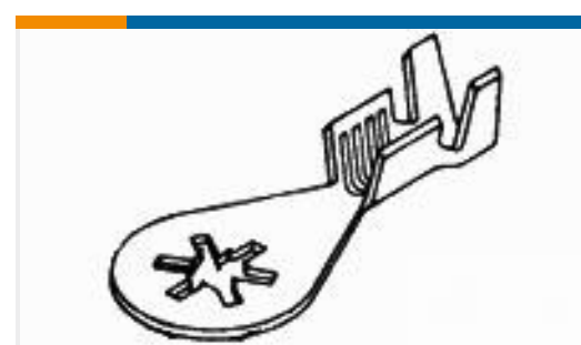
TE Part #63482-1 RING 18-14 AWG TPSTL