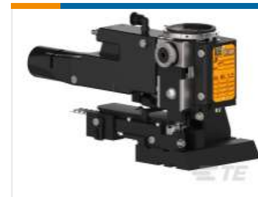
TE Part # 2-2151743-2 OCEAN_2.0_Applicator-S-080F1400V