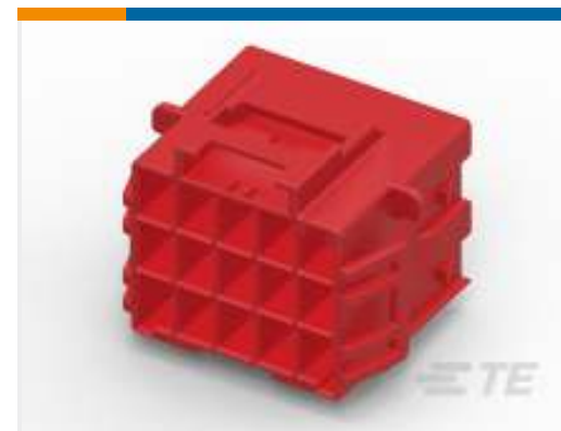
TE Part #5-1971775-3 POWER TRIPLE LOCK High Temperature Caps