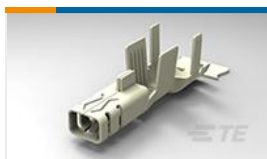
TE Part #1971785-2 PTL RECEPTACLE CONTACT, 20 - 24 AWG