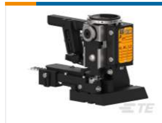
TE Part # 2-2151743-1 OCEAN_2.0_Applicator-S-080F1400V