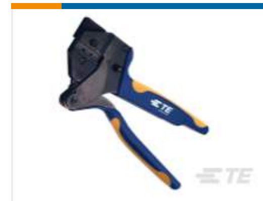
TE Part # 2217208-1 SDE COMMERCIAL TOOL AND DIE