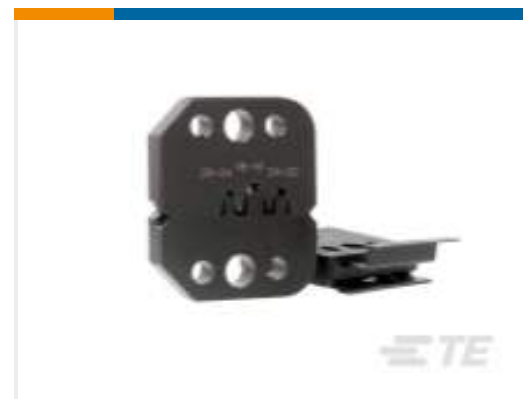
TE Part # 2217208-2 SDE DIE SET