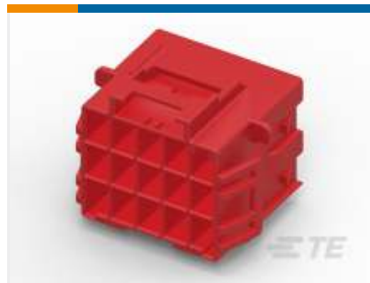
TE Part # CAT-P87074-C1701A POWER TRIPLE LOCK High Temperature Caps