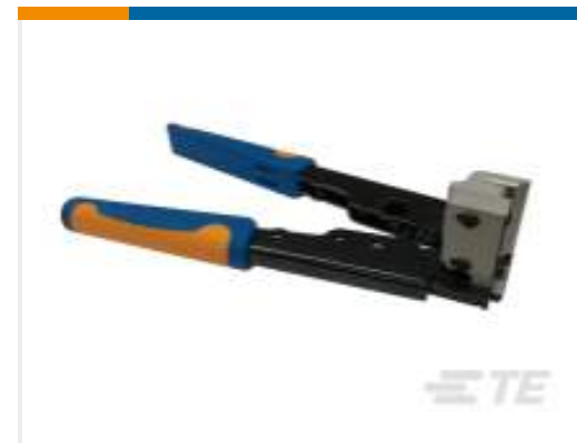
TE Part # 2305570-1 Strip Terminal Cutter-Side Feed-No Crimp