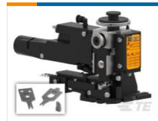
TE Part # 7-2151743-2 OCEAN_2.0_Applicator-S-080F1400V