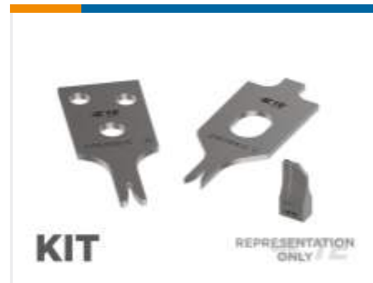
TE Part # 7-2151743-7 OCEAN_2.0_SPARE_PART_KIT-080F1400V