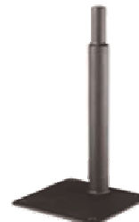
Model: 960-09 Mount Stand, 9" (203.2mm)

Click on any of the above images to find out more about the products pictured.