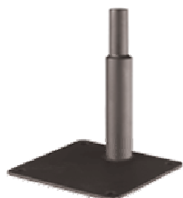
Model: 960-06 Mount Stand, 6" (127mm)