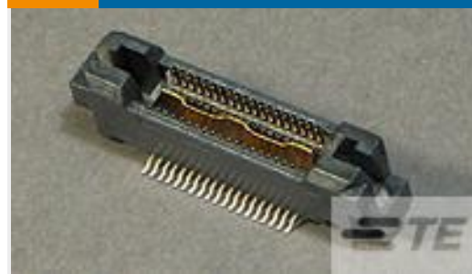
TE Part # 5767119-1 MICT,PLG,038,ASY,.025,TAPE PKG