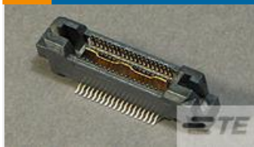
TE Part # 5767118-8 MICT,PLG,038,ASY,.025,TAPE PKG