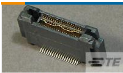
TE Part # 5767082-1 MICT,495,PLUG,038,PDNI,BARBLES