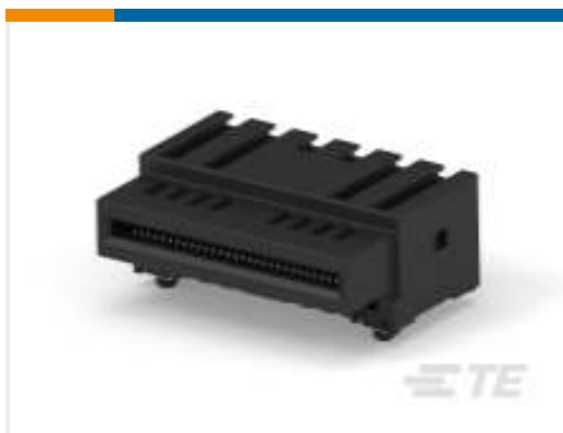
TE Part #2344064-4 CONNECTOR ASSEMBLY, SMT, OSFP 112