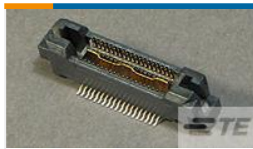
TE Part # 5767117-1 MICT,260,PLG,038,ASY,.025,PDNI