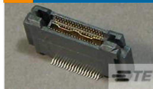
TE Part # 5767120-1 MICT,495PLG,038,ASY,.025,AUPLT