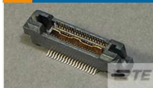
TE Part # 5767119-8 MICT,PLG,038,ASY,.025,TAPE PKG