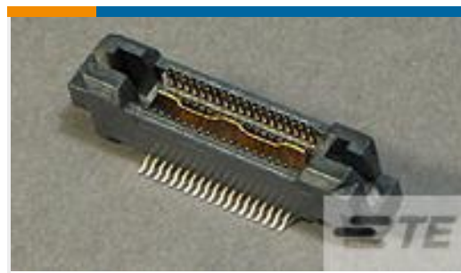
TE Part # 5767116-1 MICT,260PLG,038,ASY,.025,AUPLT