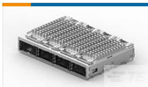
TE Part #2227249-2 1x4 Cage Assy Bhnd Bzl QSFP28