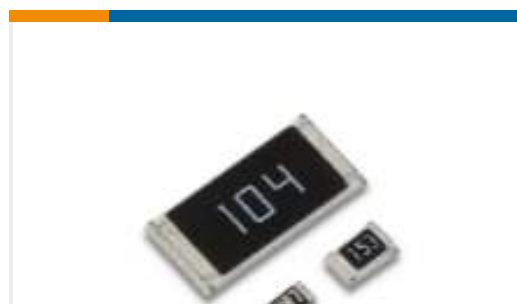
TE Part #2176339-7 CRGCO 0603 33R 1%