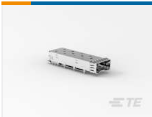
TE Part #2274001-1 ZSFP+ 1X1 CAGE ASSEMBLY PRESSFIT