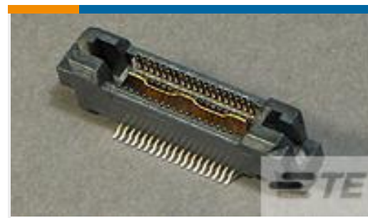
TE Part # 5767118-1 MICT,PLG,038,ASY,.025,TAPE CAP