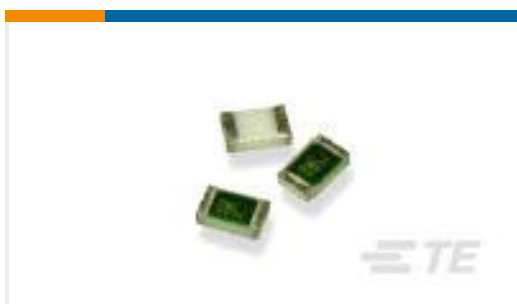
TE Part #3-1879208-6 CPF 0402 300R 0.1% 25PPM 1K RL