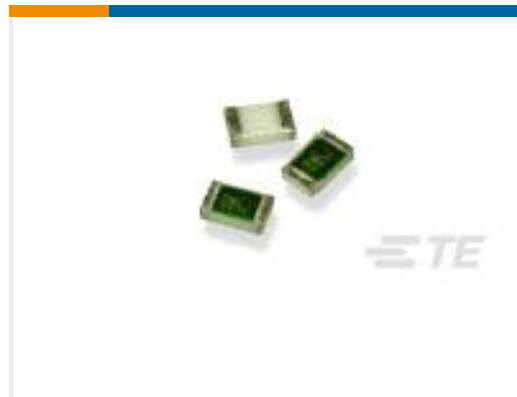
TE Part #9-1879208-7 CPF 0402 100K 0.1% 25PPM 1K RL