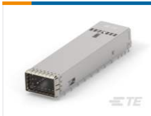
TE Part #2317416-1 OSFP 1X1 CAGE ASSEMBLY