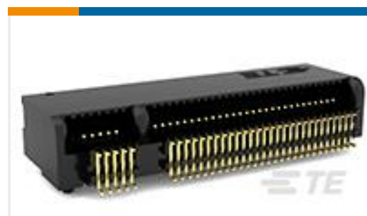
TE Part #2199230-4 M.2 0.5PITCH 4.2H KEY E 15U" AU"