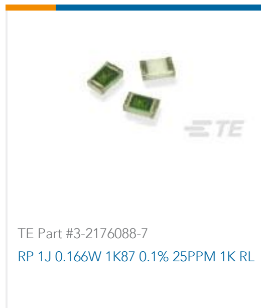
TE Part #3-2176088-7 RP 1J 0.166W 1K87 0.1% 25PPM 1K RL