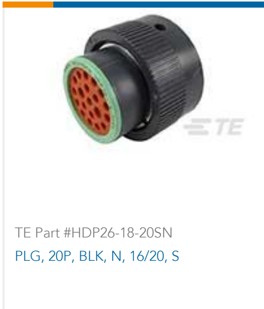
TE Part #HDP26-18-20SN PLG, 20P, BLK, N, 16/20, S