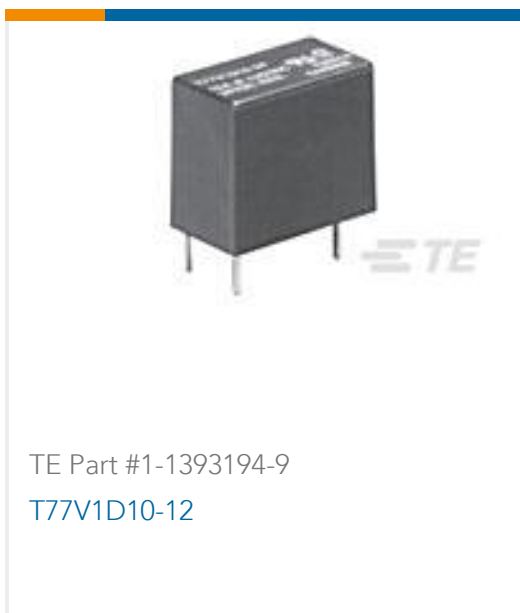
TE Part #1-1393194-9 T77V1D10-12