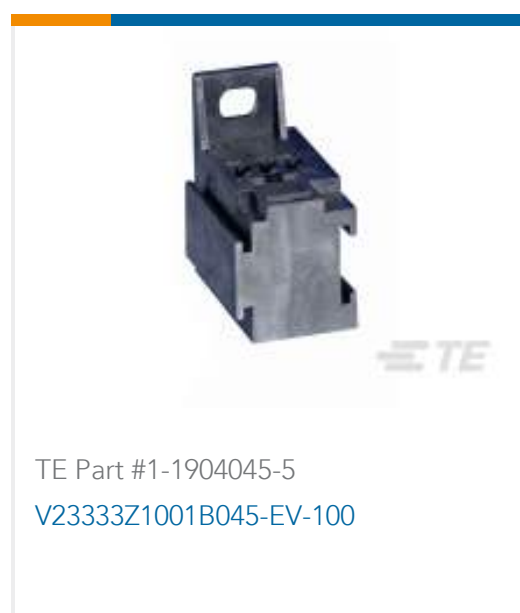
TE Part #1-1904045-5 V23333Z1001B045-EV-100