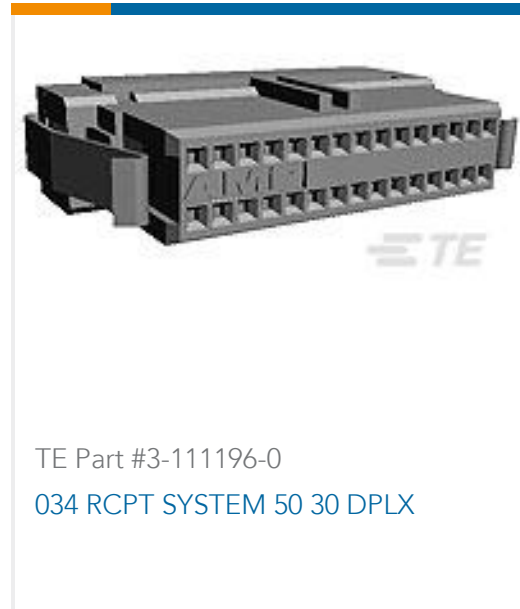
TE Part #3-111196-0 034 RCPT SYSTEM 50 30 DPLX