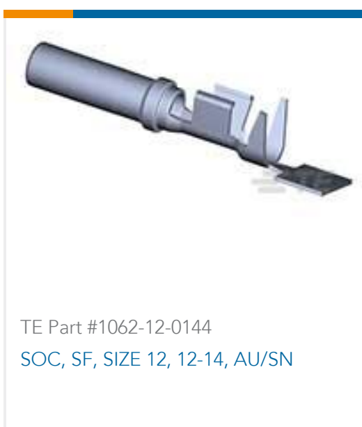
TE Part #1062-12-0144 SOC, SF, SIZE 12, 12-14, AU/SN