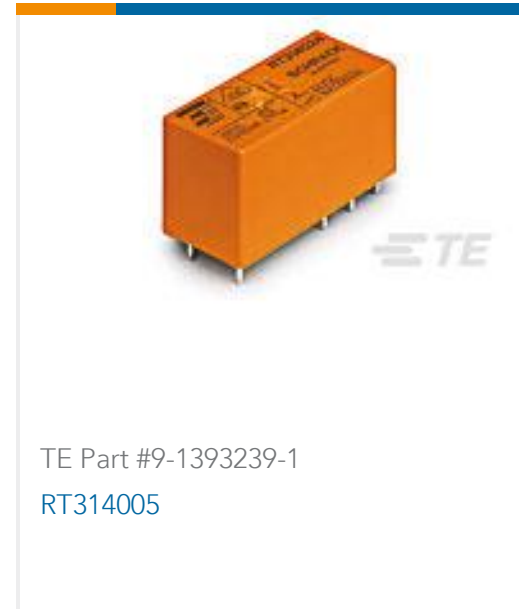
TE Part #9-1393239-1 RT314005