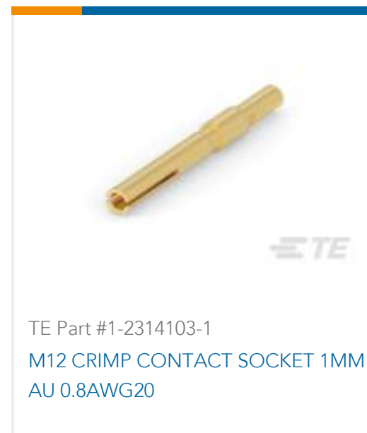
TE Part #1-2314103-1 M12 CRIMP CONTACT SOCKET 1MM AU 0.8AWG20