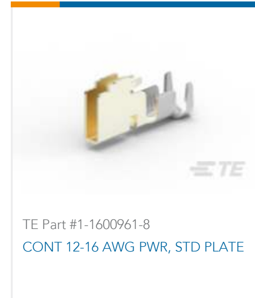
TE Part #1-1600961-8 CONT 12-16 AWG PWR, STD PLATE