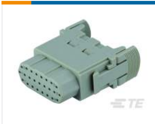
TE Part #T2111252201-000 HMN-025-F