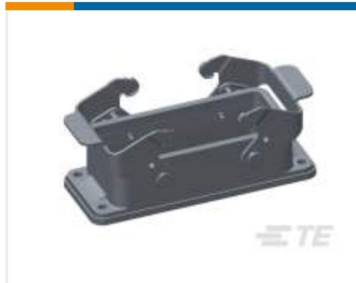
TE Part #T1410162000-000 H16B-AG