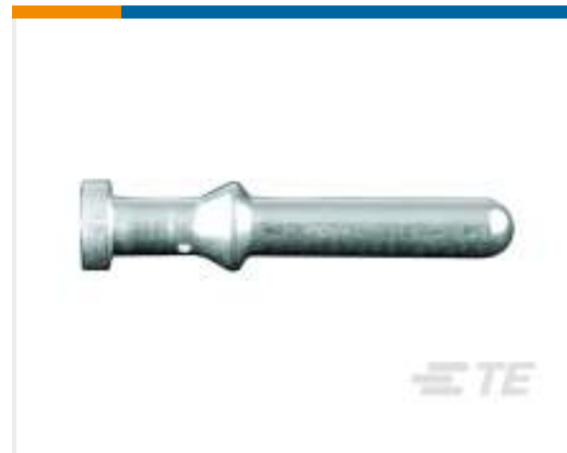
TE Part #T2040001040-000 CMM-4.0