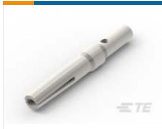
TE Part #T2070002033-000 CAF-33