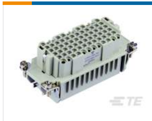
TE Part #T2030722201-000 HDD-072-F