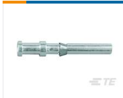
TE Part #T2020002008-000 CDF-0.75