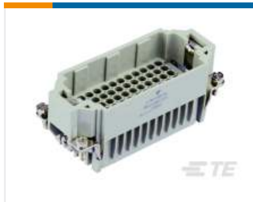
TE Part #T2030722101-000 HDD-072-M