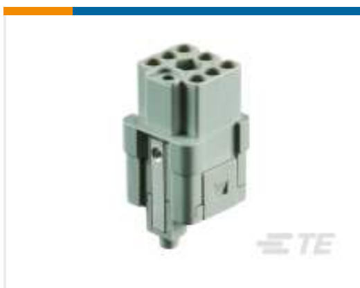
TE Part #T2080072201-000 HQ-007-F