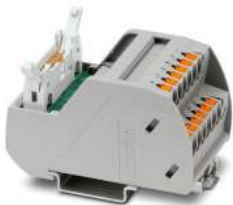
VARIOFACE interface module, with push-in connection and light indicator, for 8 channels

https://www.phoenixcontact.com/us/products/2904279