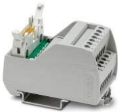
VARIOFACE interface module, with LED, for 8 channels

https://www.phoenixcontact.com/us/products/2322249