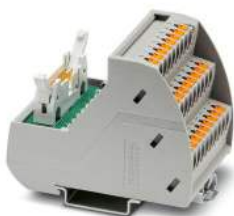
VARIOFACE sensor module, for connecting 8 pnp sensors, with LED

https://www.phoenixcontact.com/us/products/2904281