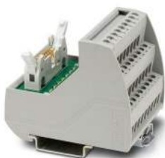
VARIOFACE sensor module, for connecting 8 pnp sensors, with LED

https://www.phoenixcontact.com/us/products/2322265