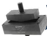
Sheet metal punch for rectangular openings, Dimensions opening: 46 x 46 mm, Maximum wall thickness: 2.0 mm for stainless steel sheet, Material: steel