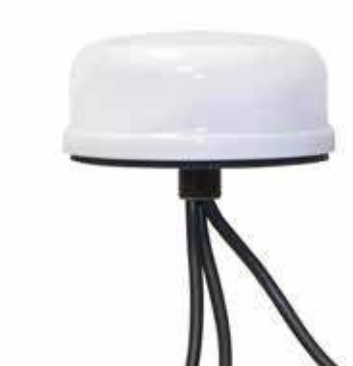
MIMO Low Profile Surface Mount Antennas available with 2 or 3 MIMO elements

Many of the newest wireless networks, are moving towards greater use of MIMO (Multiple-Input-Multiple-Output) systems and MIMO Antennas.