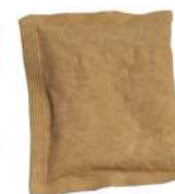
Desiccant in Kraft Pouch