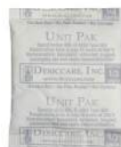
Desiccant in Tyvek® Pouch