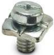
PE screw, for HC-HS contact inserts

Please be informed that the data shown in this PDF Document is generated from our Online Catalog. Please find the complete data in the user's documentation. Our General Terms of Use for Downloads are valid ( http://download.phoenixcontact.com )