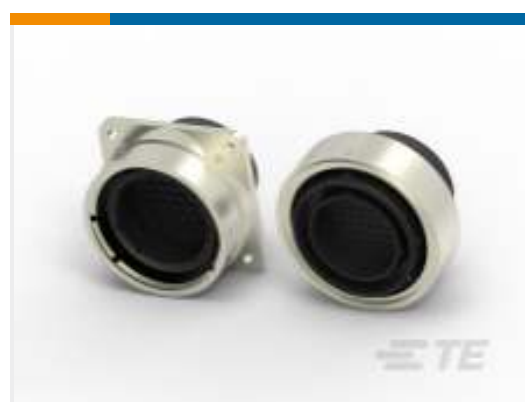
TE Part # CAT-AM71-C83998C Circular Plastic Connector, CMC Series 1