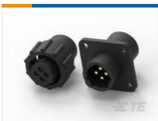
TE Part # CAT-AM71-C83998J Cable/Panel Mount Connector, CPC Series 1