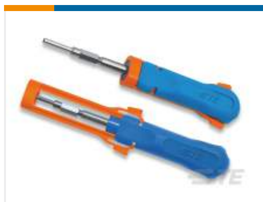
TE Part # 539972-1 EXTRACTION TOOL