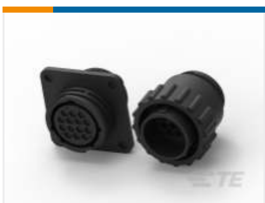
TE Part # CAT-AM71-C83998K Circular Connector, Environmentally Sealed, CPC Series 6