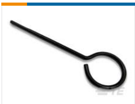
TE Part # 200893-2 INSERTION TOOL CONT