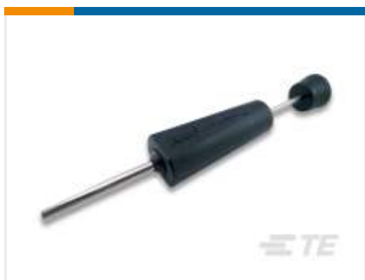
TE Part # 305183 EXTRACT TOOL TYPE 2 20-16