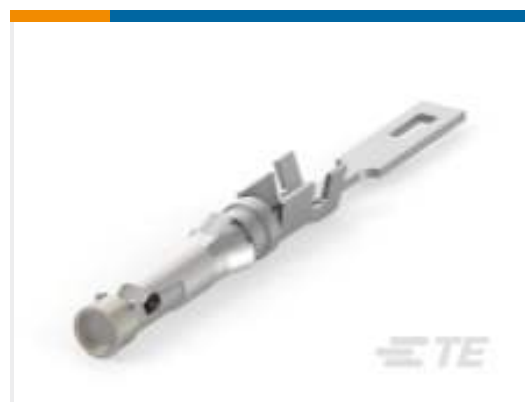
TE Part # 202237-5 III+ SOC, SOLTAB, TIN, LP