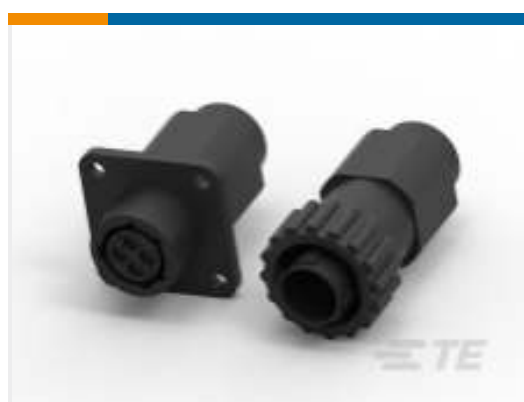
TE Part # CAT-AM71-C83998Y One-Piece Connector, Sealed, CPC Series 1