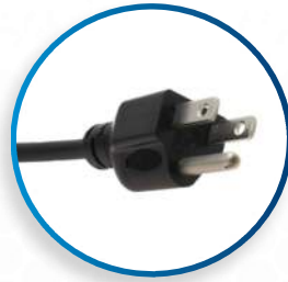
6 ft Power Cord w/ 100V Plug