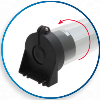
120 ° Adjustable Illumination