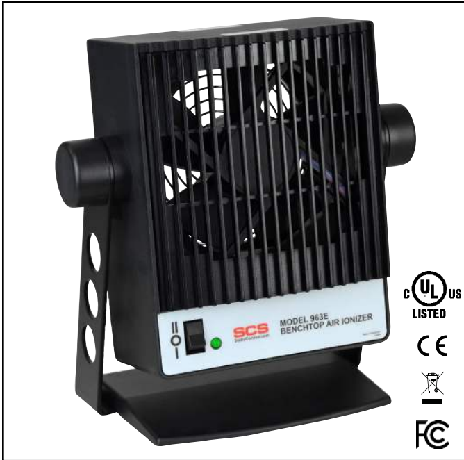
Figure 1. SCS 963E Benchtop Air Ionizer

The 963E Benchtop Air Ionizer and its accessories are available as the following item numbers: