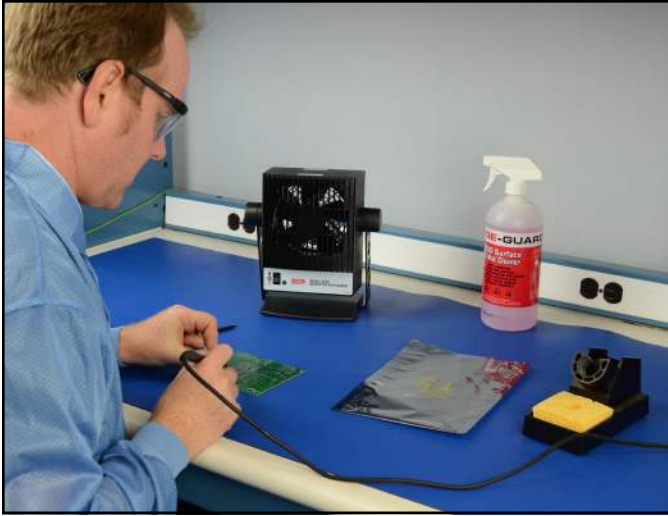
Figure 2. Using the 963E Benchtop Air Ionizer