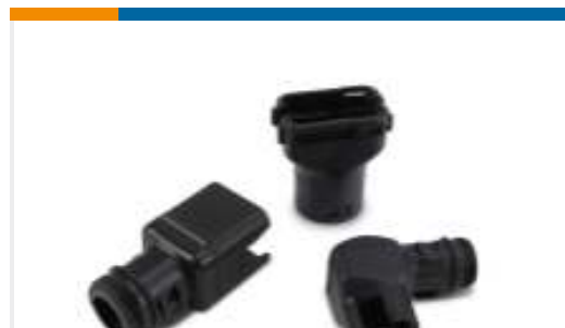
TE Part #1011-263-0405 DEUTSCH DT Backshells