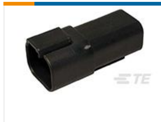
TE Part #DT04-4P-E004 REC, 4P, BLK, N