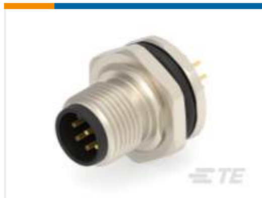
TE Part #T4140012081-000 M12,REAR MOUNT,MALE,A,8P, SOLDER PCB