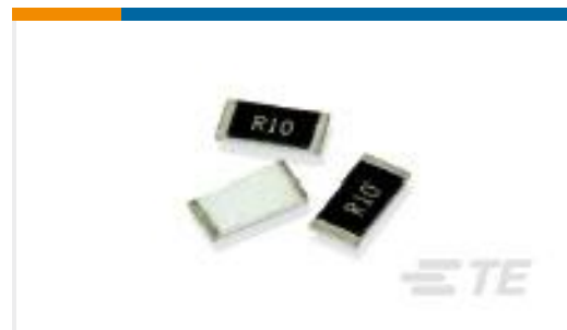
TE Part #1-2176057-9 RLP73N 3A R056 1% 1K RL