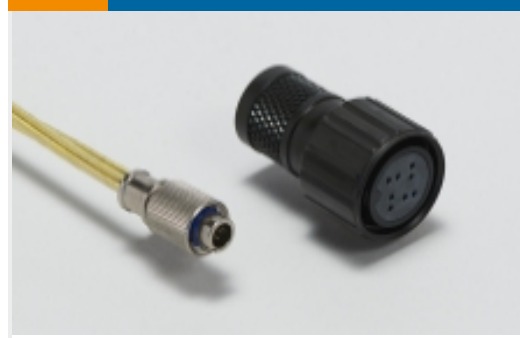
Standard Circular Connectors(521)