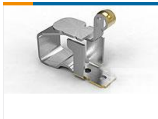
TE Part #1551575-5 Shield Finger, Loose Piece