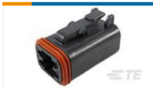
TE Part #DT06-4S-E004 PLG, 4P, BLK, N