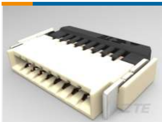
TE Part #2328702-6 6PIN 0.5MMP FPC CONNECTOR, BACK FLIP LOCK