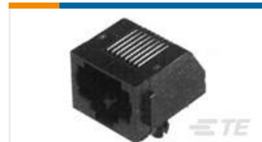
TE Part #5555077-1 MJ,LPF,R/A,6P/6C,SMT,PNL STOP