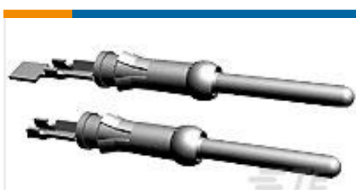
TE Part #1-66107-0 III+ PIN,26-24,30AU/FL,SMPACK