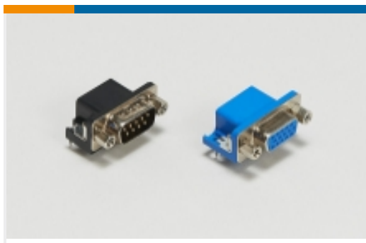
PCB D-Sub Connectors(353)