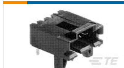
TE Part #5-103904-2 3 MTE HDR SRRA LATCH W/HLDWN