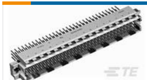
TE Part #4-1393659-7 V42254B1202R963=PC612 MESSERLE