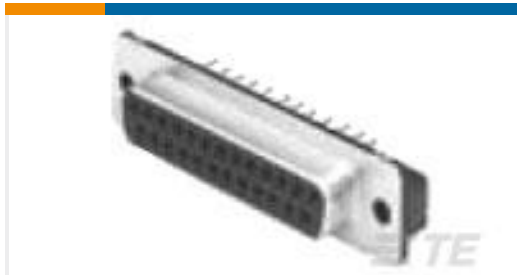
TE Part #1-745967-4 25 RCPT SP/FMS SCRLK