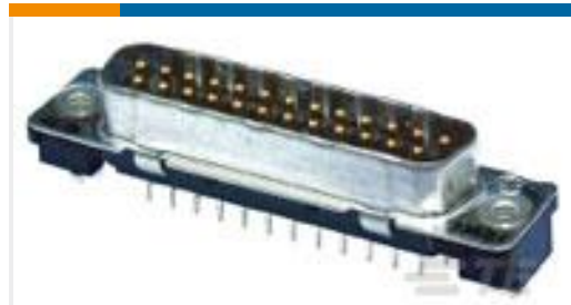
TE Part #3-338310-2 15POS.HD20 PLUG ASSY