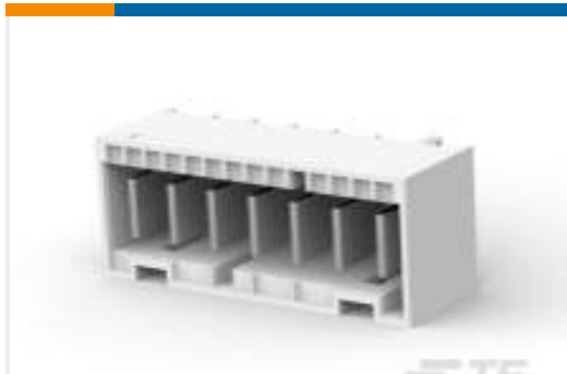
TE Part #2232532-7 7P, PL RAST 5 Tab Header, TH,Vertical