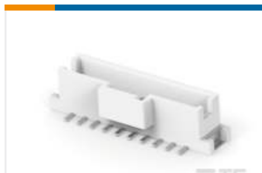
TE Part #2-2232829-0 SGI2.0 HEADER ASSEMBLY SMT 10P, KEY A,NTL