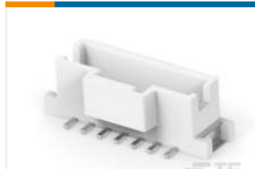
TE Part #1-2232829-7 SGI2.0 HEADER ASSEMBLY SMT 7P, KEY A,NTL