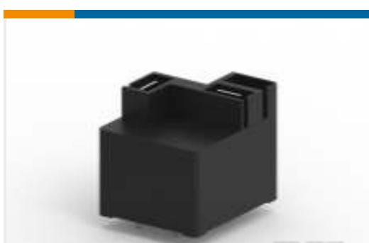
TE Part #2-1423091-1 T9AV1L22-12