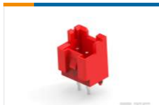
TE Part #2338245-2 EP2.5 HDR 2P VERT BOSS,RED,UL