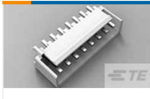
TE Part #1-1877285-1 11P EP SHRD HDR ASMY, WHITE