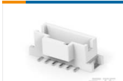
TE Part #1-2232829-6 SGI2.0 HEADER ASSEMBLY SMT 6P, KEY A,NTL