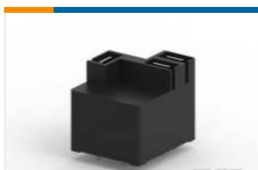
TE Part #2071229-6 T9AV5L22-12