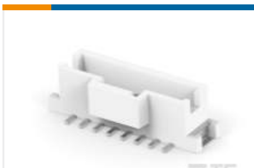
TE Part #1-2232829-8 SGI2.0 HEADER ASSEMBLY SMT 8P, KEY A,NTL