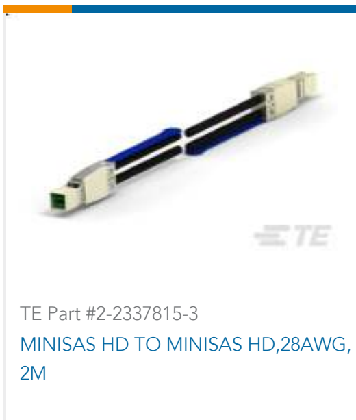
TE Part #2-2337815-3 MINISAS HD TO MINISAS HD,28AWG, 2M