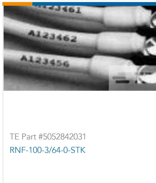
TE Part #5052842031 RNF-100-3/64-0-STK