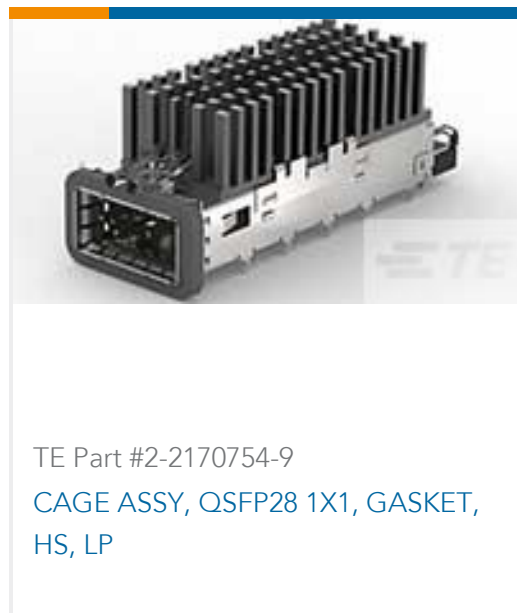
TE Part #2-2170754-9 CAGE ASSY, QSFP28 1X1, GASKET, HS, LP