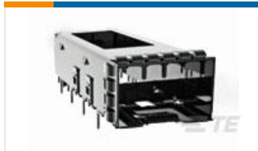
TE Part #2007198-2 SFP+ 1x1 Cage Assembly, Press-Fit