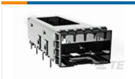
TE Part #2170261-1 SFP+ Enhanced 1x1 Cage Assembly