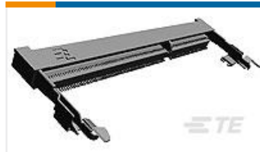
TE Part #2-2013297-1 EMBOSS TAPE DDR3 204P 8H STD