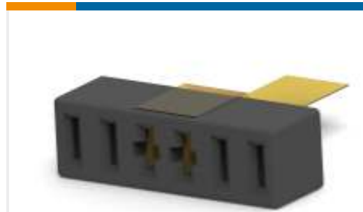
TE Part #1926303-1 Cover Connector, FLATPAQ