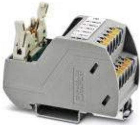
VARIOFACE Professional (VIP) board for the ROC800 controller

Please be informed that the data shown in this PDF Document is generated from our Online Catalog. Please find the complete data in the user's documentation. Our General Terms of Use for Downloads are valid ( http://phoenixcontact.com/download )