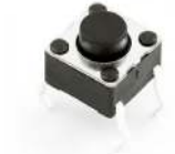
Push Buttons (6 Pcs)