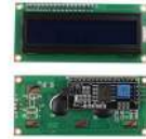
I2C LCD Display