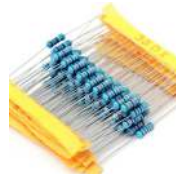
Resistors: 220 (20 Pcs), 10K (10 Pcs), 1K (10 Pcs)