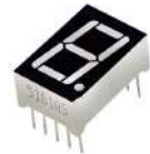
7 Segment Display (Common Cathode)