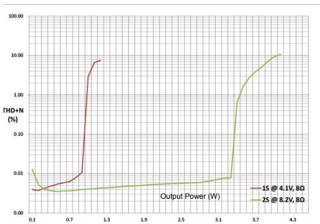
THD+N vs Output Power for different battery configurations