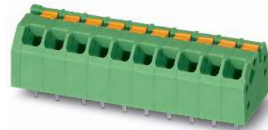
The figure shows 10-pos. standard item (without EX marking)

PCB terminal block, Push-in spring connection