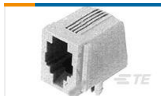
TE Part #5555980-1 MJ,R/A,4P/4C,TRAY PACK