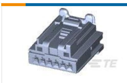
TE Part #2035363-2 1X6 GENERATION Y ASSY KEYB CPA