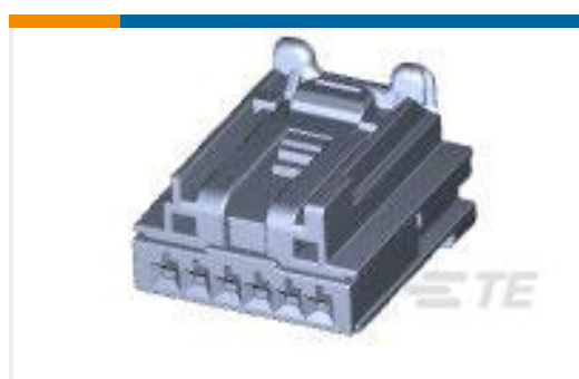
TE Part #2035363-1 1X6 GENERATION Y ASSY KEY B