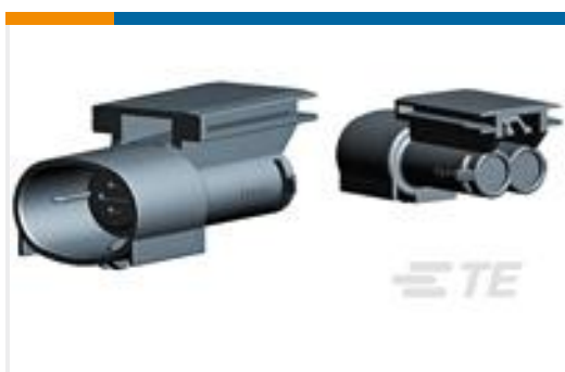
TE Part #1897213-2 MCP 6.3 2P CAP HSG