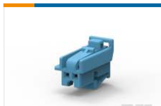
TE Part #3-929080-5 2POS MQS REC COD C