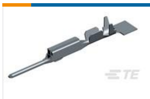
TE Part #1924968-4 Contact, male 0.64, 18 AWG