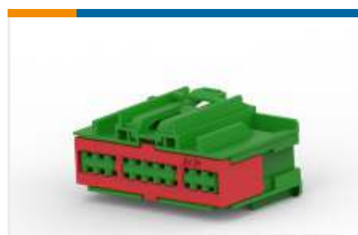
TE Part #1-2208021-4 22POS,0.64 GENER. Y,REC HSG,ASSY