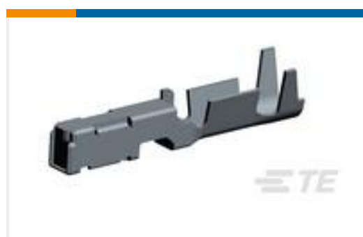
TE Part #1924955-3 CONTACT,FEMALE0.64,20-22AWG, UNSEAL