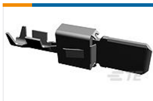
TE Part #1-963736-2 TAB 5.8x0.8 CONTACT CS SRC Ag