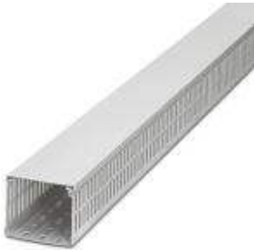
Cable duct, white, comprising upper part and mounting base, width: 100 mm, height: 60 mm, length: 2000 mm

Please be informed that the data shown in this PDF Document is generated from our Online Catalog. Please find the complete data in the user's documentation. Our General Terms of Use for Downloads are valid ( http://download.phoenixcontact.com )