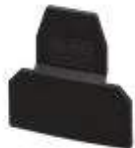
End cover, Length: 56 mm, Width: 2.5 mm, Height: 66.5 mm, Color: black