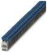
Connection terminal block, Connection method Screw connection, Load current : 76 A, Cross section: 1.5 mm 2 - 16 mm 2 , Width: 9.8 mm, Color: blue

Connection terminal block - AKG 16 BU - 0423014