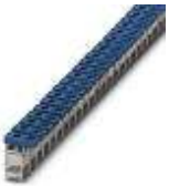
Connection terminal block, Connection method Screw connection, Load current : 125 A, Cross section: 2.5 mm 2 - 35 mm 2 , Width: 14.3 mm, Color: blue

Connection terminal block - AKG 35 BU - 0424013