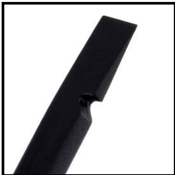
Flat Screwdriver End with Notch for Hooking Wires