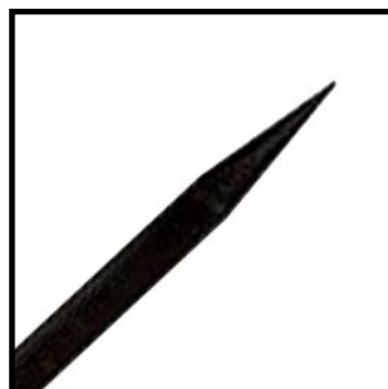
Pointed End to Form Wire Leads, Probing and Holding Objects