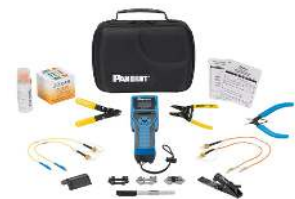
FOCOT2-BKIT (Patch cords available separately or in termination kits)

***Substitute for fiber type: For multimode, insert XAQ for 50/125µm, 5BL for 50/125µm, or 6EI for 62.5/125µm.