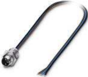
Sensor/actuator flush-type plug, 3-pos., M8, front/screw mounting, with M8 thread, with 0.5 m TPE litz wire, 3 x 0.25 mm 2

Please be informed that the data shown in this PDF Document is generated from our Online Catalog. Please find the complete data in the user's documentation. Our General Terms of Use for Downloads are valid ( http://download.phoenixcontact.com )