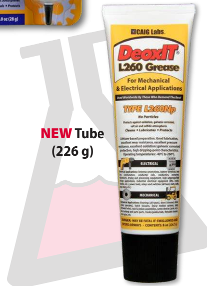
NEW Tube (226 g)