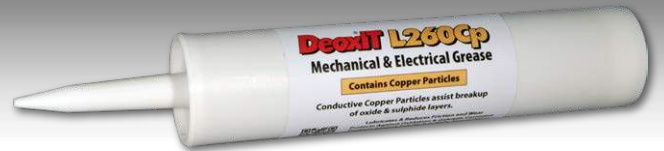
Caulking Tube (226 g)