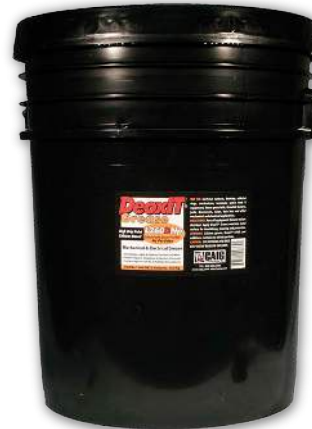
Pail (15.9 KG)