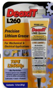
NEW Retail Tube (28 g)