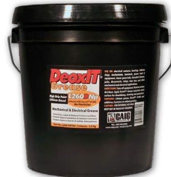
Small Pail (3.6 KG)