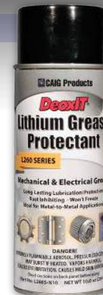
Sprays (10.0 oz / 284 g)