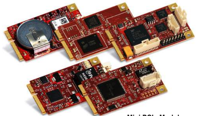
Mini PCIe Modules