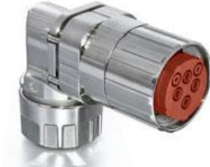
Contact Arrangement mating view

C SD A 480 NN 00 44 0050 000 C U A 480 N 00 44 0050 000