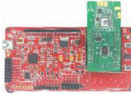
Fig 4: Programming and debugging with CY8CKIT-042-BLE Pioneer Kit Baseboard

Note: Jumper on CYBLE-202013-EVAL's J3 header can be connected or disconnected.