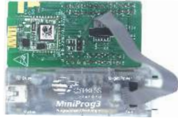
Fig 3: Programming/Debugging with MiniProg3

Connect the MiniProg3 to the J4 10-pin header