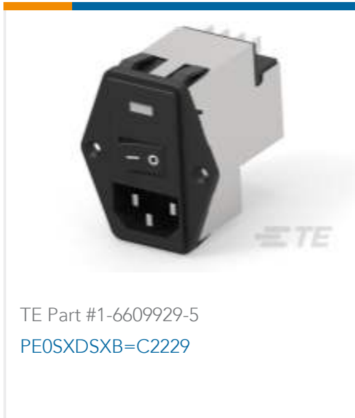
TE Part #1-6609929-5 PE0SXD SXB=C2229