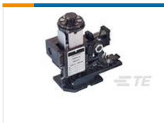
TE Part # 1855184-2 HDM w/FA EAPR110F1700 K