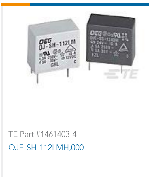
TE Part #1461403-4 OJE-SH-112LMH,000