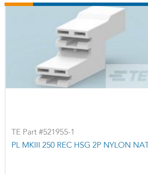
TE Part #521955-1 PL MKIII 250 REC HSG 2P NYLON NAT