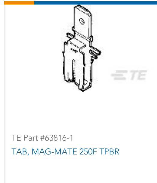
TE Part #63816-1 TAB, MAG-MATE 250F TPBR