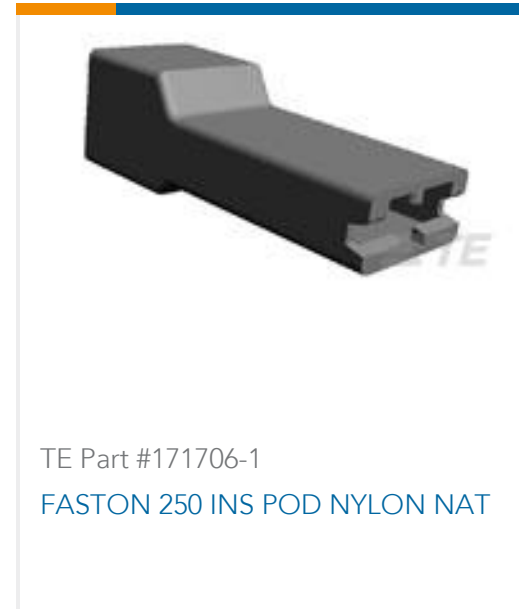
TE Part #171706-1 FASTON 250 INS POD NYLON NAT