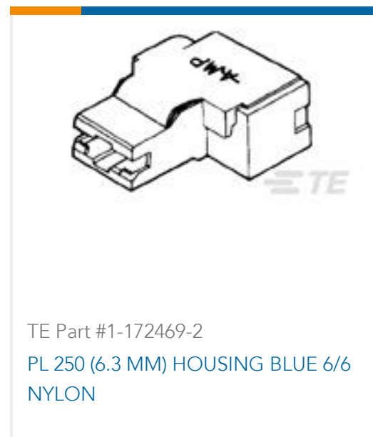
TE Part #1-172469-2 PL 250 (6.3 MM) HOUSING BLUE 6/6 NYLON