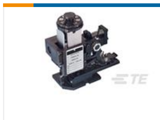
TE Part # 1855184-1 HDM w/FA EAPR110F1700 LM & G