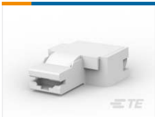
TE Part # 1-172469-1 PL 250 HOUSING NATURAL 6/6 NYLON