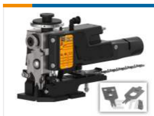
TE Part # 7-2150856-2 OCEAN_2.0_Applicator-E-110F1730