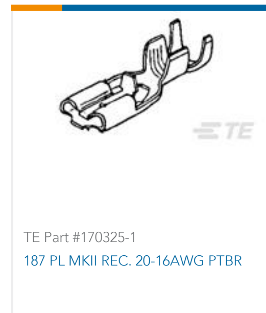
TE Part #170325-1 187 PL MKII REC. 20-16AWG PTBR