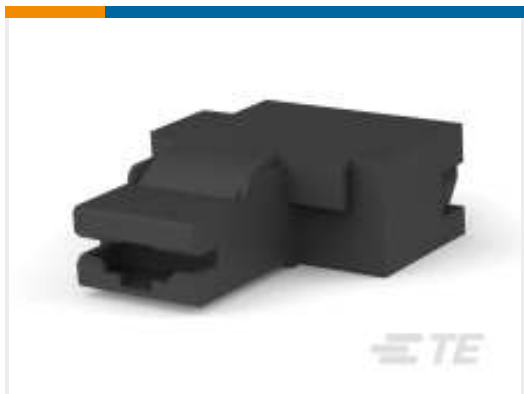
TE Part # 172469-8 PL MKII 250 REC HSG 1P NYLON BLCAK FLAG