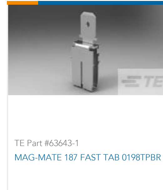
TE Part #63643-1 MAG-MATE 187 FAST TAB 0198TPBR