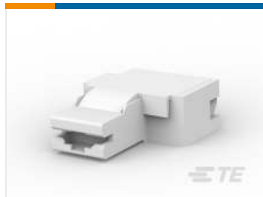
TE Part # 172469-1 POSITIVE LOCK 250 (6.3 MM) HOUSING