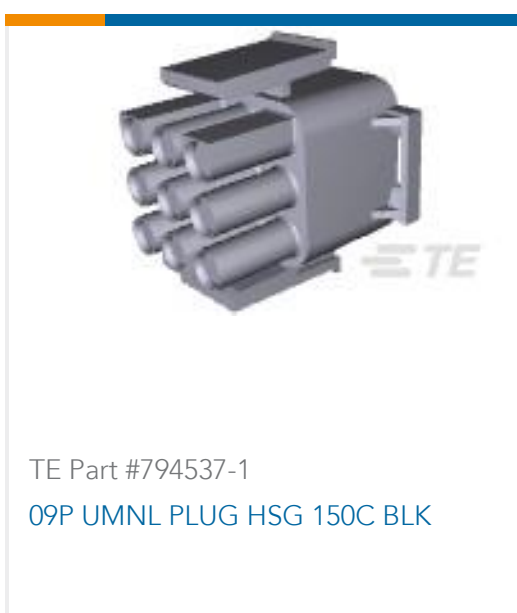
TE Part #794537-1 09P UMNL PLUG HSG 150C BLK