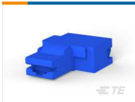
TE Part # 1-172469-2 PL 250 (6.3 MM) HOUSING BLUE 6/6 NYLON