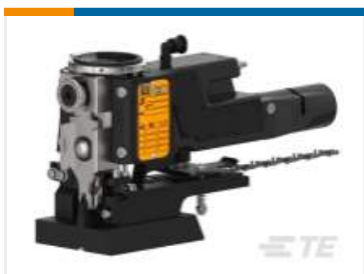
TE Part # 2-2150856-2 OCEAN_2.0_Applicator-E-110F1730