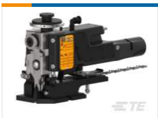
TE Part # 2150856-2 OCEAN_2.0_Applicator-E-110F1730